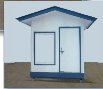
Mobile cabin on wheels