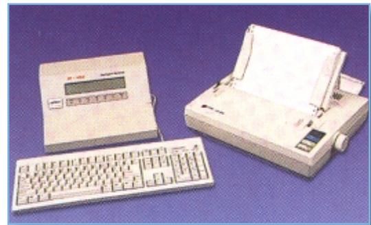
Terminal Keyboard & Printer (Optional Items)

The software choice for the above are many. The customer can either develop the software in house or choose from the Ashbee library. Model Alpha and Model Beta have similar features and are suitable for most weighbridge applications. While Model Alpha has a built-in keyboard, Model Beta uses an external computer keyboard. Ashbee software engineers can take up challenging assignments to fulfill clients' needs. For example, interconnection of several weighbridges through LAN or wireless connection, consolidation of reports on a common computer and centralized invoicing.