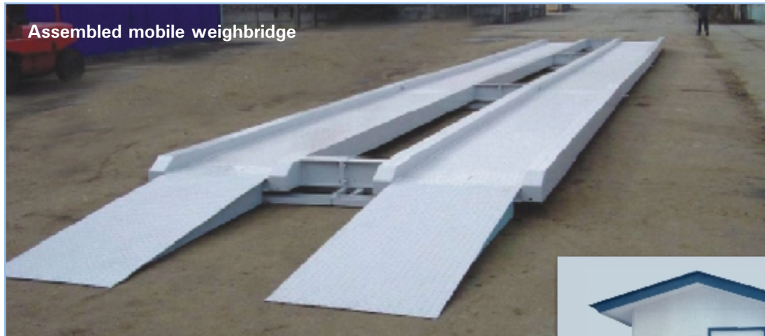
Assembled mobile weighbridge