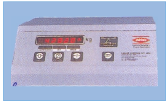
Digital Weight Indicator