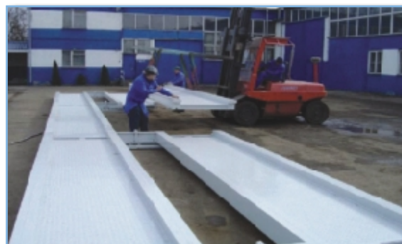
Installation of intermediary sections. Sections are installed on top of first and last platform section by means of male/female construction. This is for 3 platform section construction as in 16x3m and 18x3m mobile weighbridge